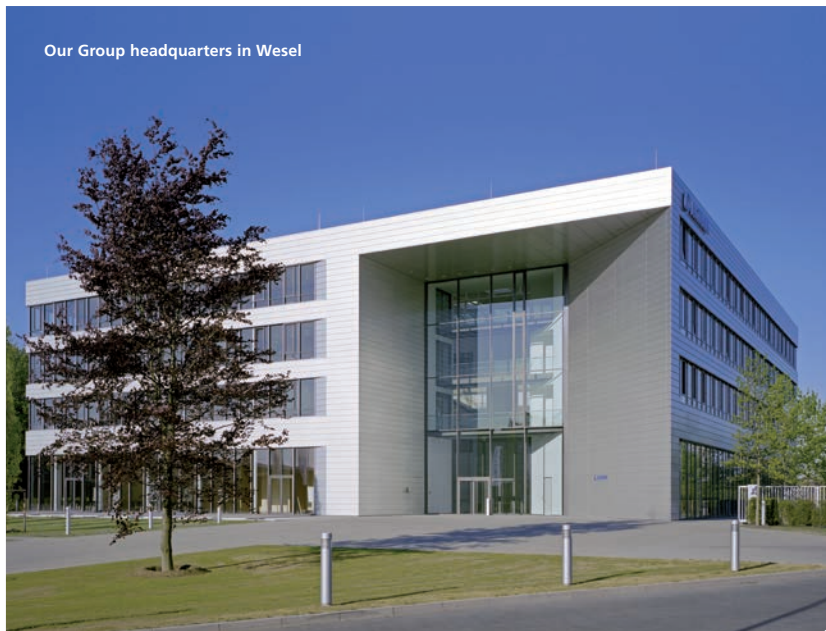
Our Group headquarters in Wesel

The ALTANA Group develops and manufactures high-quality, innovative products in the specialty chemicals business. ALTANA delivers the goods that make modern life what it is. For example, when food stays fresh longer thanks to better packaging, when engines function more reliably, and when coatings shine. ALTANA and the four divisions BYK, ECKART, ELANTAS, and ACTEGA have set themselves the task of adding something very special.